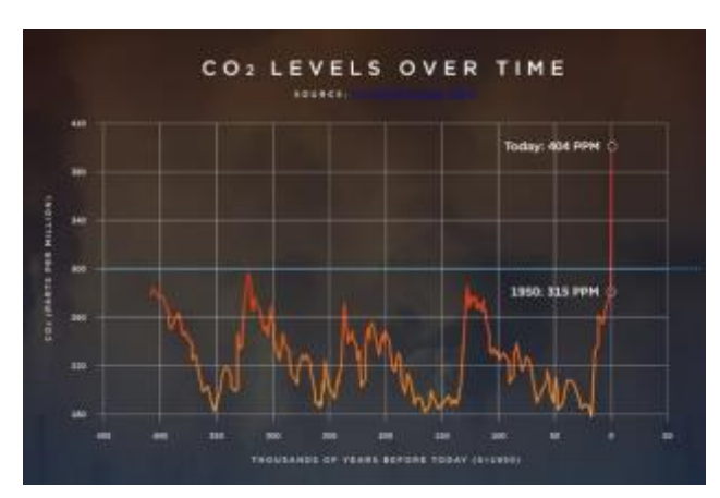
Record High CO<sub>2</sub> Levels

Tesla's mission has always been to help solve this problem by accelerating the world's transition to sustainable energy. To achieve this, energy needs to be sustainably generated, sustainable energy needs to be stored for later use, and sustainable