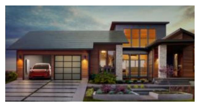
Sustainable Energy Future

During last week's live Powerwall 2 and solar roof launch event, we shared our vision for how we can create this integrated sustainable energy future. That vision consists of three pieces. First, there will be a solar roof that will generate sustainable energy from a rooftop that looks better and is more durable than a normal roof, that can be easily customized to fit the unique needs